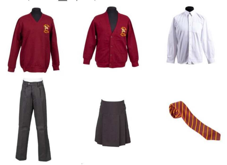
Reception Class, Years 1-6 Summer Uniform to be worn in Terms 1, 5 and 6 (September until October half term and summer terms)